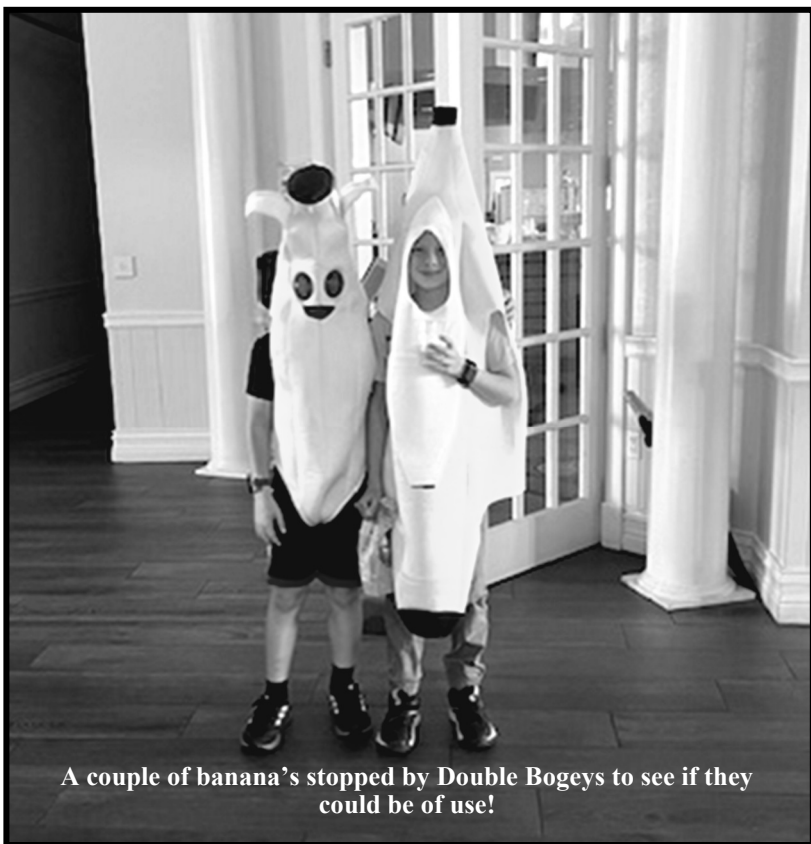
A couple of banana’s stopped by Double Bogeys to see if they could be of use!