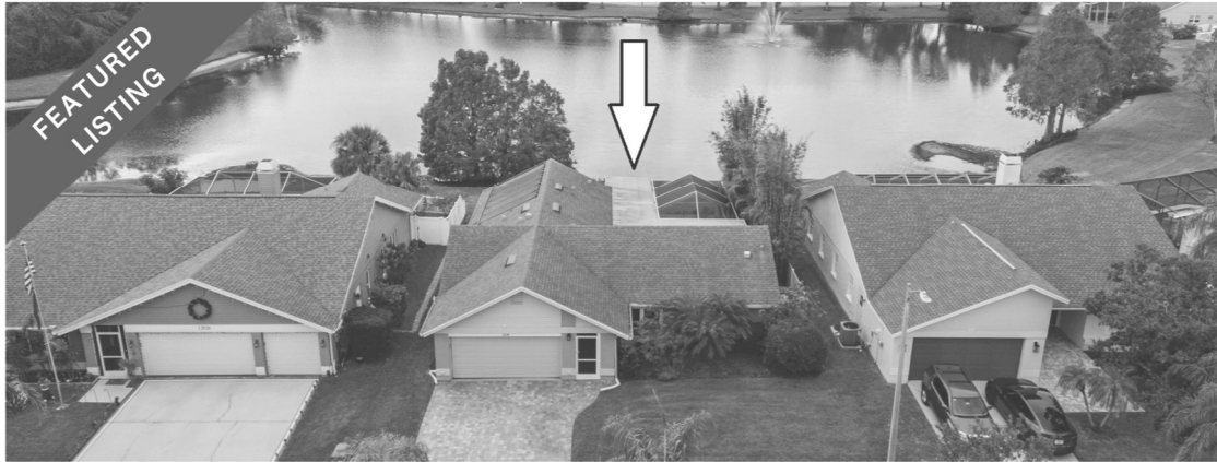
12038 Steppingstone Blvd. 4 beds | 3 baths | 1,775 sq.ft. | $574,900