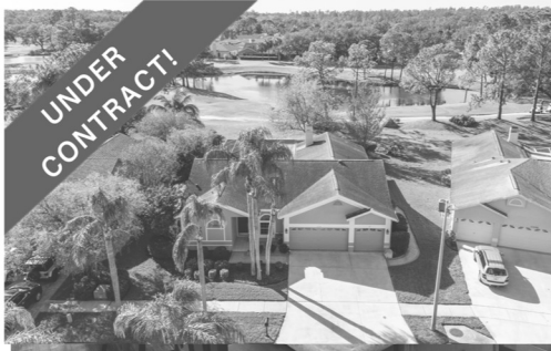
11228 Bloomington Drive 4 beds | 3 baths | 2,129 sq.ft. | $699,500