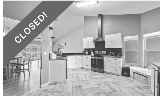
8725 Boysenberry Drive 4 beds | 2 baths | 1,646 sq.ft. | Sale Price $550,000