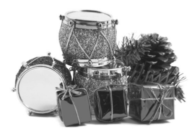
NEW HORIZONS December 13 • 7:30 pm