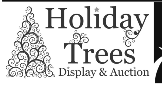
AVAILABLE NOW! 25 UNIQUELY-THEMED TREES Ends on December 15 • 9 pm