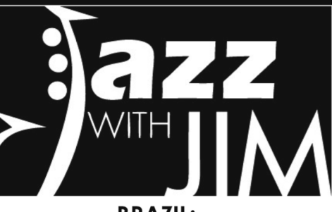
BRAZIL: SAMBAS & BOSSA NOVAS December 6 • 7:30 pm