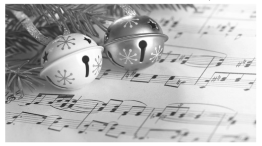
CARROLLWOOD WINDS December 8 • 4 pm